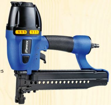
PRO-MEDIUM CROWN STAPLER PR-16851P