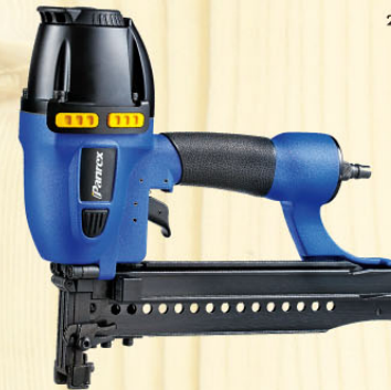
PRO-MEDIUM CROWN STAPLER PR-16951P